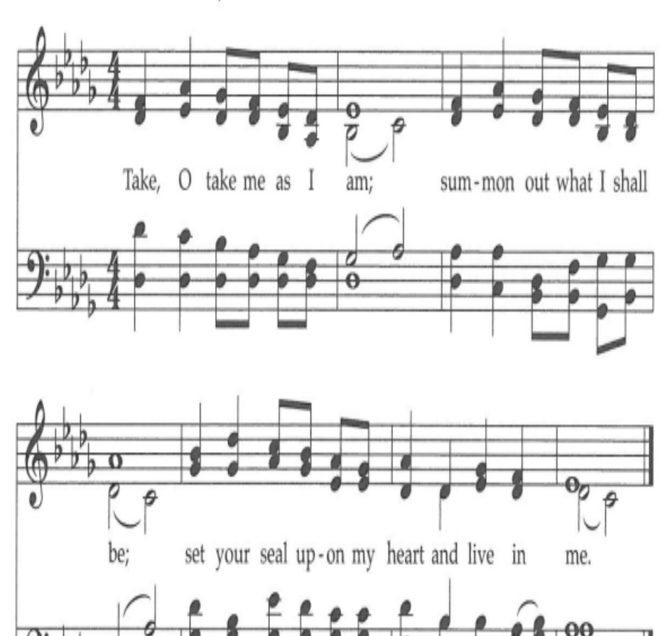
Take, O Take Me as I Am