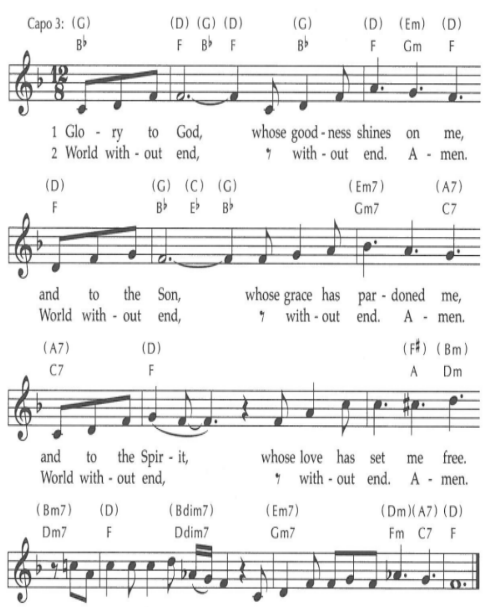
As it was in the be-gin-ning, is now and ev-er shall be. A-men.